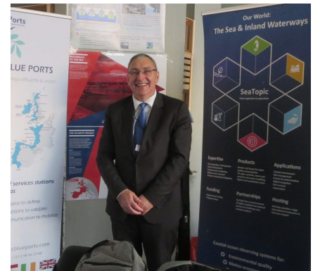
Picture right - the Atlantic Blue Ports stand during TEN-T days 2018 in Ljubljana, Slovenia.

In both cases, these contacts were starting points to link the Project to ongoing actions in Europe to reduce pollution caused by shipping activities and to help ports and member states improve their ship’s waste reception/treatment facilities. The Project’s partners are very happy with this positive exposure to policymakers and are confident it will help realise the Project’s ultimate goal of developing new and improved port services for a greener future!